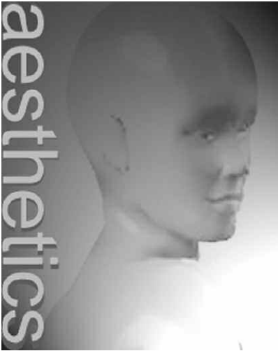
Natasha Vita-More, 2009

to provide knowledge about aesthetics of radical human enhancement